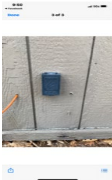
Old Black Box