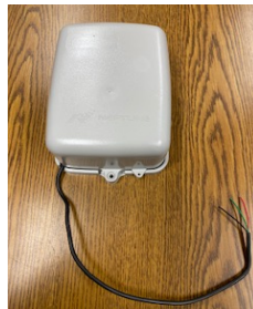
New Grey Box